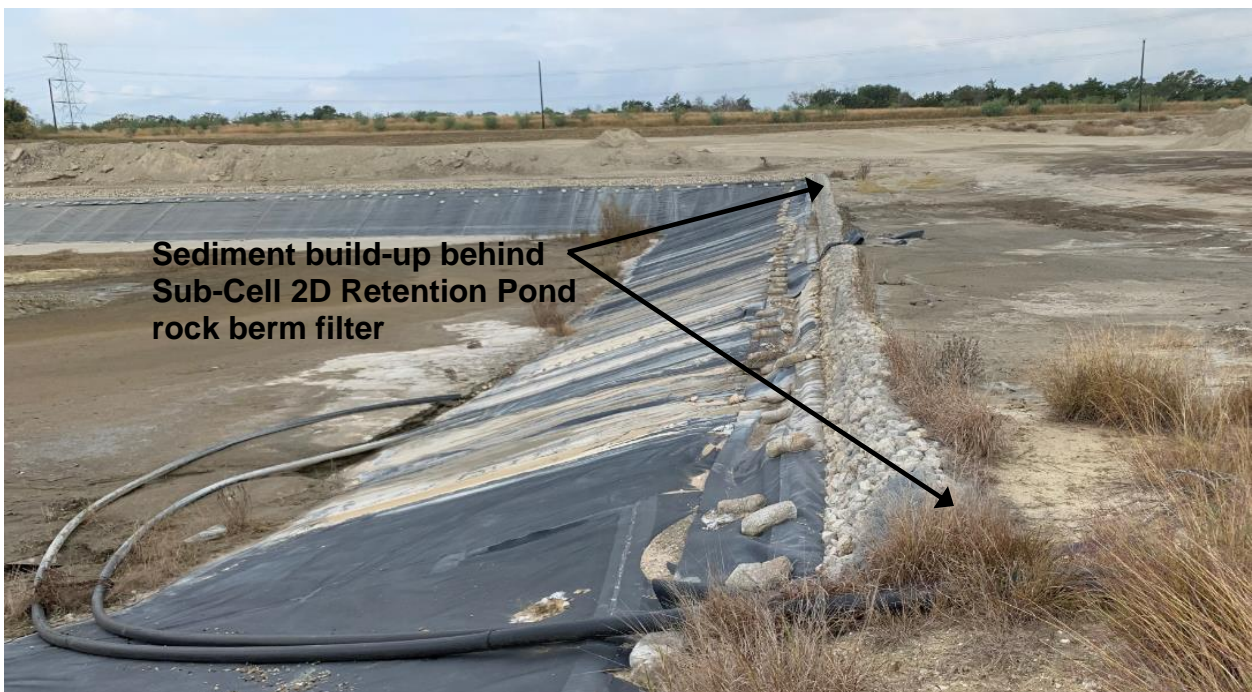
PHOTO 2 – View of excessive sediment build-up behind rock berm filter (11-13-2020)