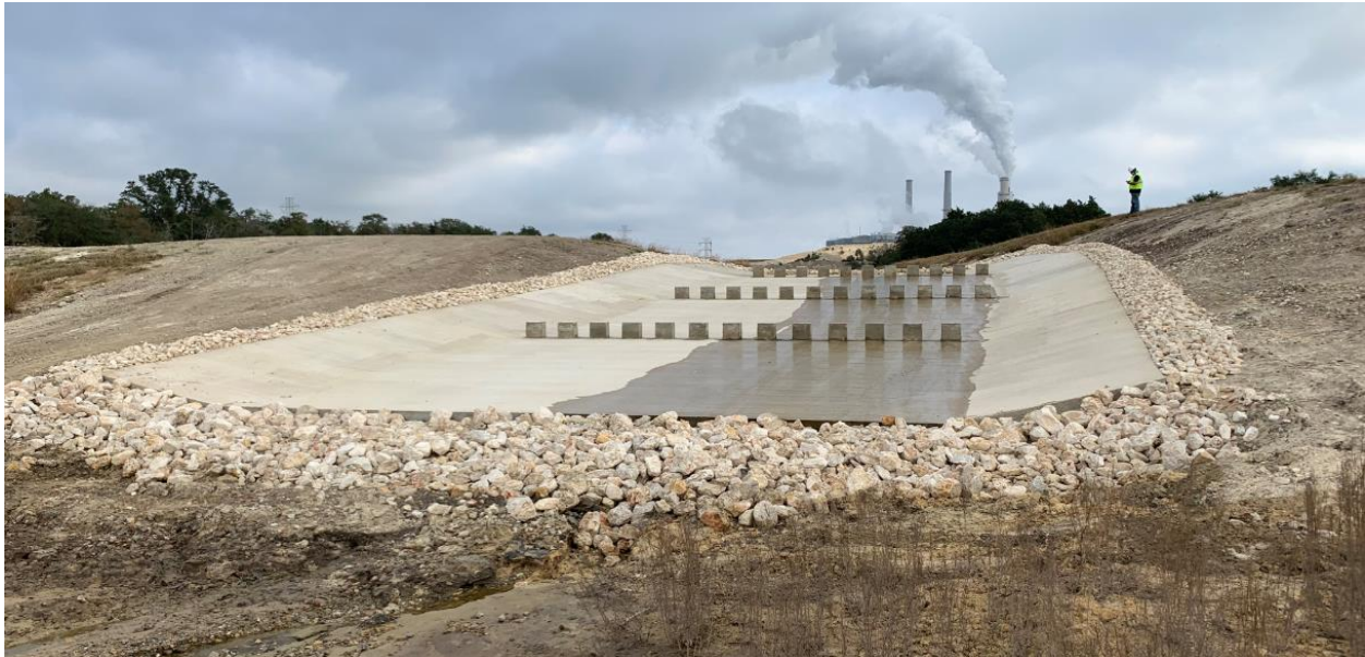
PHOTO 1 – View of new CBL Channel Discharge Structure at the CBL Pond (11-13-2020)