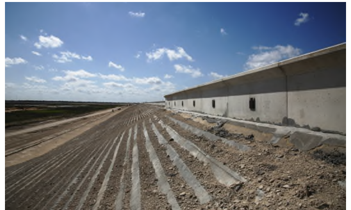
Custom-built concrete parapets along the top of the embankment will prevent wave action that could damage the reservoir.

Since the reservoir will be a dynamic water operation that will be filled and drained frequently, it will not be available for recreation such as boating or swimming.