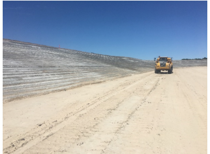
A truck waters down the sides of the new reservoir, which is strengthened with soil cement, during construction in 2017.