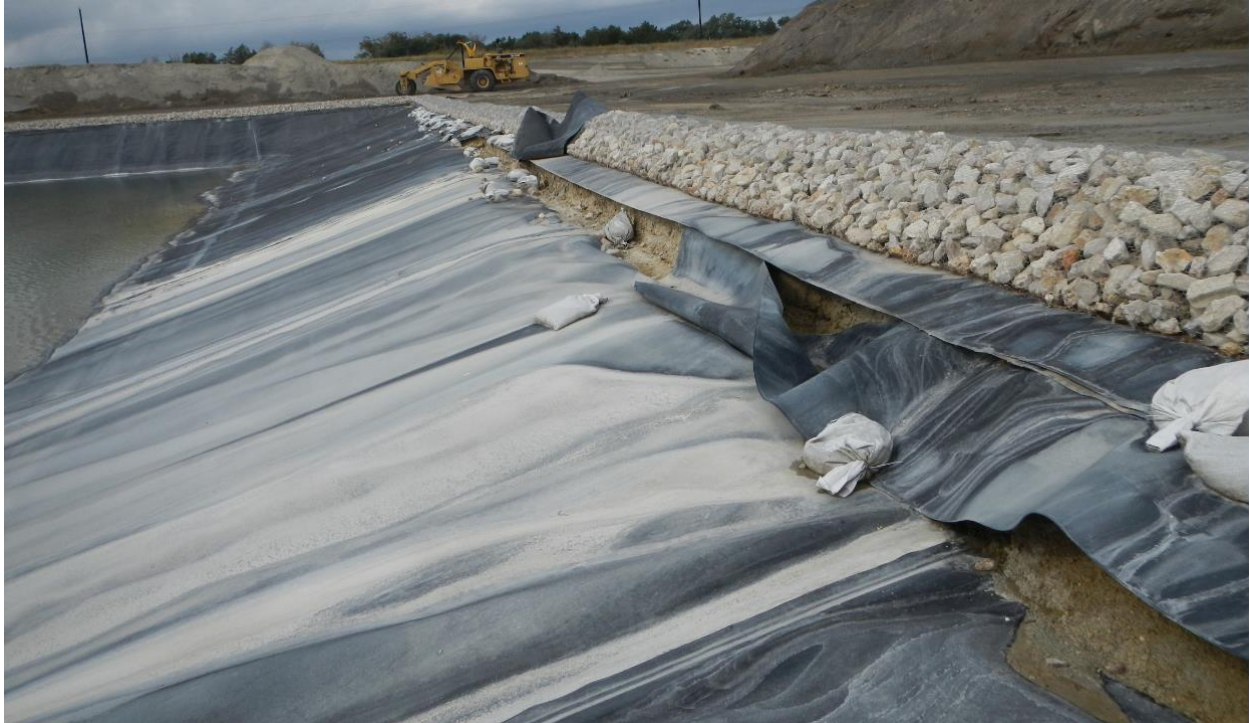
PHOTO 3 – View of Subcell 2D Pond North Slope Rock Silt Berm (11-18-2016)