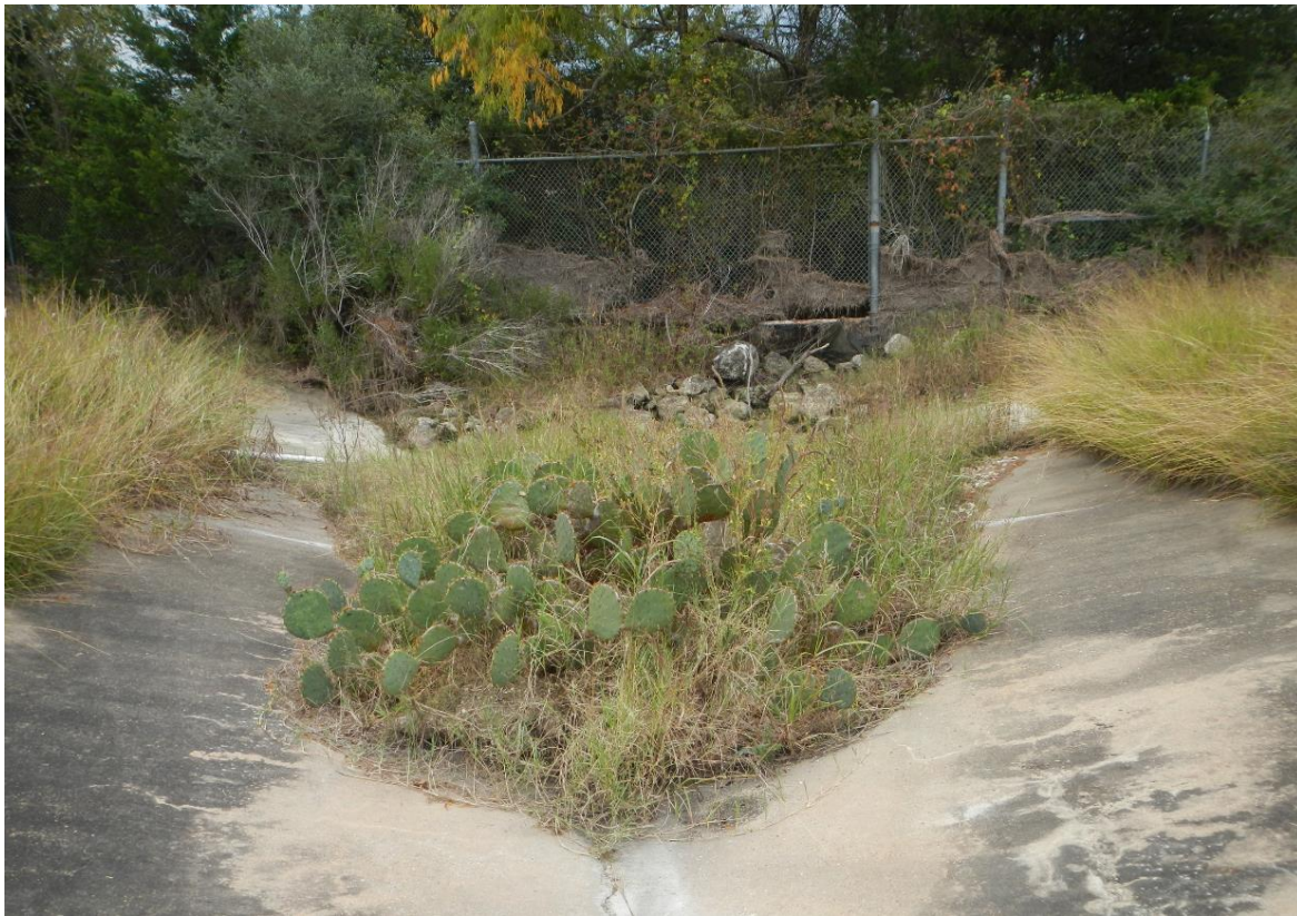
PHOTO 2 – View CBL Runoff Pond Spillway Looking South (11-18-2016)