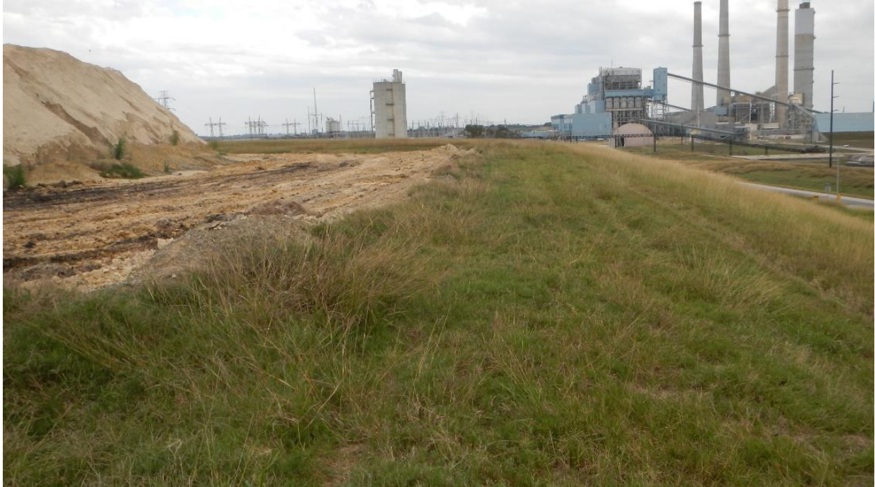
PHOTO 1 – View of East Embankment from Crest Looking North (11-18-2016)