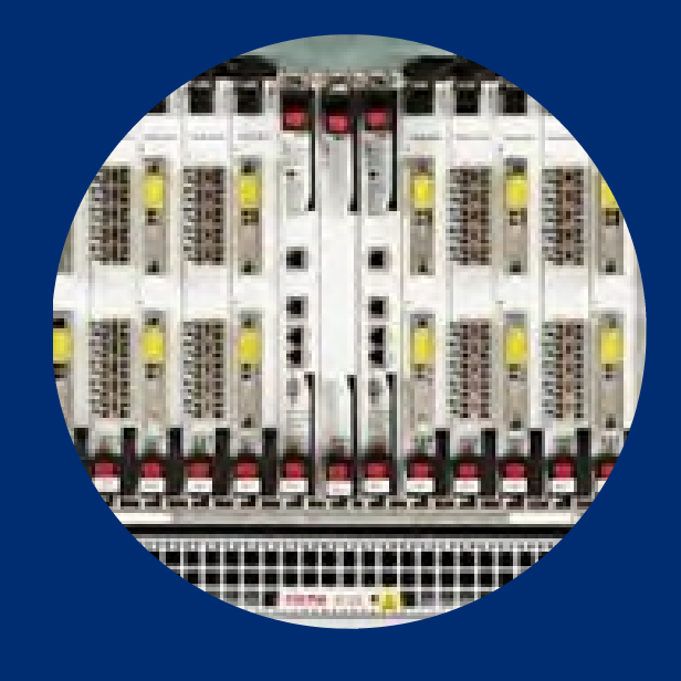
Networking gear and cybersecurity